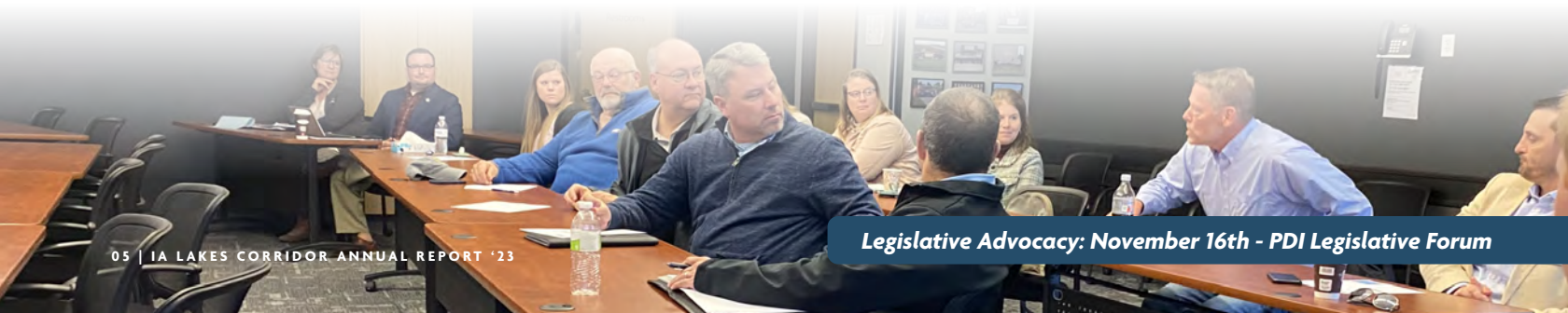
Legislative Advocacy: November 16th - PDI Legislative Forum