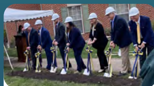
BUENA VISTA UNIVERSITY NEW RESIDENCE HALL STORM LAKE