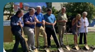
SPENCER HOSPITAL EMERGENCY DEPARTMENT SPENCER

NOT PICTURED - ICC New Learning Center, Storm Lake and Woodruff Construction, Spencer.