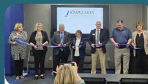
ILCC SPIRIT LAKE REGIONAL CAREER ACADEMY SPIRIT LAKE