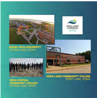
Economic Development Week Featured projects/stories.