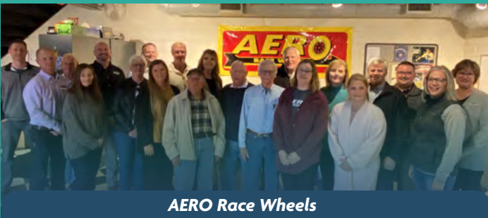
AERO Race Wheels