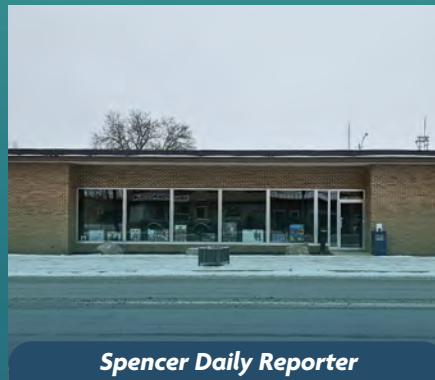
Spencer Daily Reporter

When the Spencer Daily Reporter (SDR) building came up for sale due to relocation, Corridor staff assisted the SDR team both to market the space on Location One Information System (LOIS) and to find a new location. Doll Distributing in Spencer was looking for a new facility to help house their growing portfolio, and the SDR building was a great fit! This transaction assisted two local businesses in finding spaces that fit their respective business needs. DID YOU KNOW? Location One Information System (LOIS) is a free resource to search for and market available sites and buildings to site selectors and businesses! Contact our team for more details.