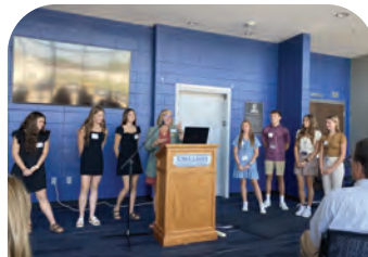
SEPTEMBER NWIA STEM