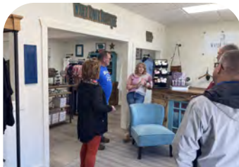
APRIL Lake Park Tour, NWIA Die Cast, Dakota Business Finance