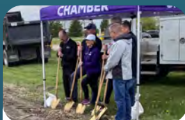
NORTH Y SPENCER

The Corridor attended and participated in multiple groundbreakings and events celebrating new programs and development across the four-county region including: