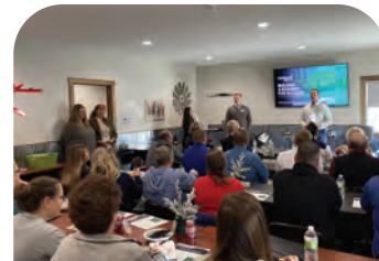
NOVEMBER RIDES Commute with Enterprise Program