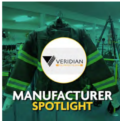
Manufacturing Month Featured companies, stats & facts!