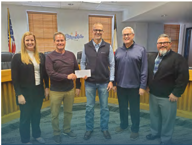
PRESENTING TYSON FOODS GRANT

community meetings | childcare facility assistance | support and resources for employers | plus more